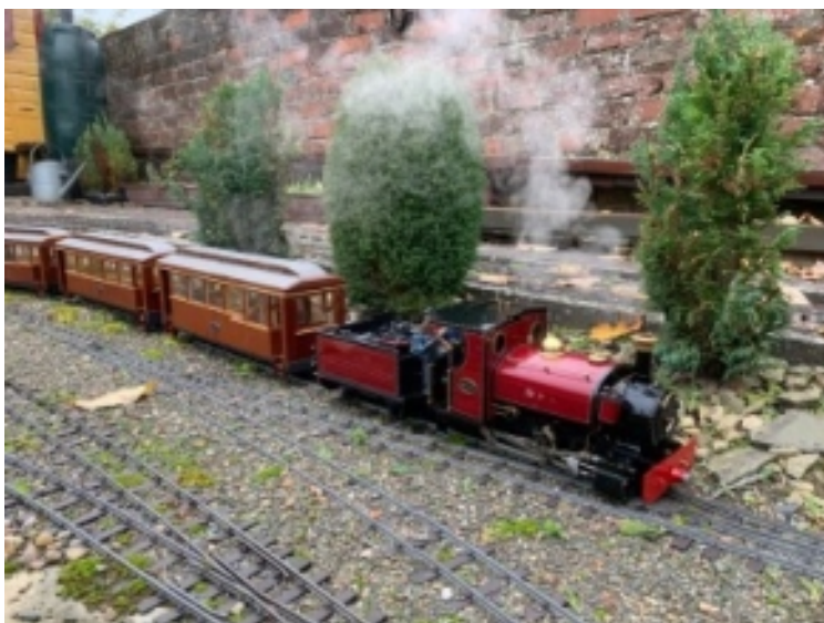
1977 ELSA, she was 45mm but after some messing about has been reduced back to 32mm. Some might say 'shame'!!!! Lovely hard wood coaches. These are vintage and have been a lot of work to repair/replace bogies, remove the ancient non working couplings and fit new. Some paint damage yet to repair and possible parts upgrade to do.