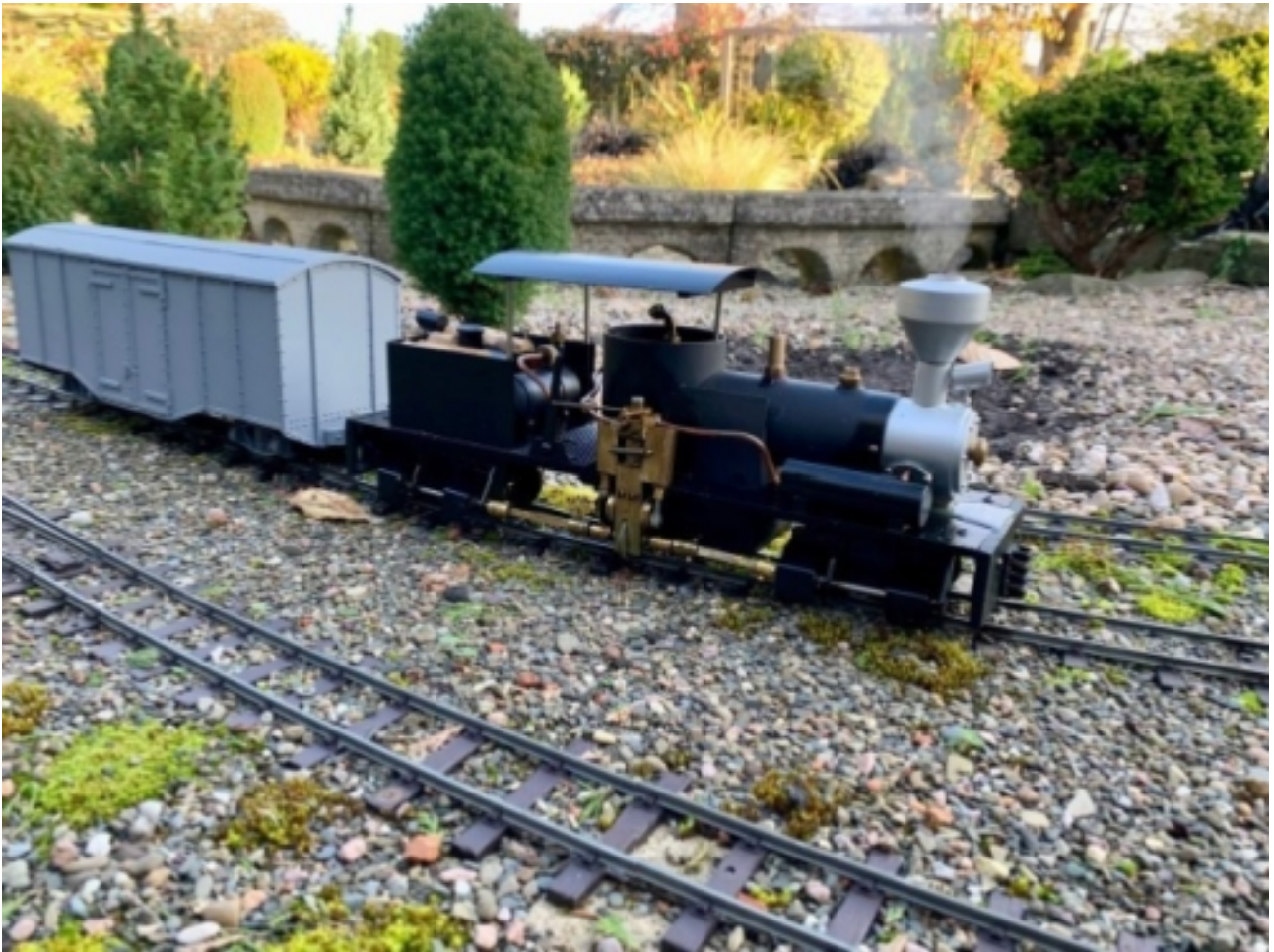
A scratch built Shay. A basic externally gas fired loco, usually a tricky thing to do but works well, very smooth running. Also a brand new van, built in the morning, and out on the track after lunch!